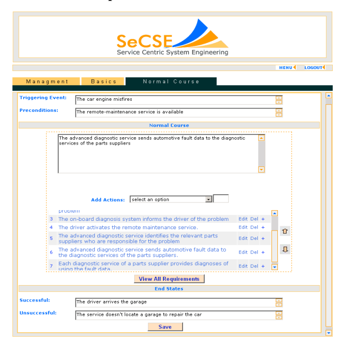
Figure 9. The use case specification modeled in the SeCSE environment.

As in the previous iteration, the service integrator can create a query to discover candidate services for one function of the system using the action description and the requirements associated with that action – that is the bolded text in Figure 8. Retrieved service descriptions can again be used to refine that part of the use case specification, and in particular refine and trade-off the satisfaction of non-functional requirements that cannot be complied with fully from the available services.